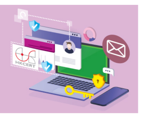
HKCERT will match the IP addresses provided by participating organisations of the "Healthcare Cyber Security Watch Pilot Programme" with their cyber threat database for compromised systems, inform them of any compromise detected and help them clean up their compromised systems

"We will match the IP addresses provided by participating organisations with our cyber threat database for compromised systems, inform them immediately of any compromise detected and help them clean up their compromised systems. The service is free of charge," remarked Mr Lai and he welcomed all local public and private hospitals, clinics and other HCPs to join the programme.