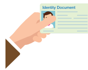
Smart ID Card