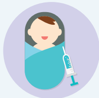
Birth and Immunisation Records