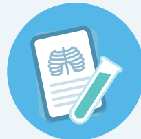
Laboratory and Radiology Reports