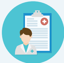
Clinical Note/ Summary