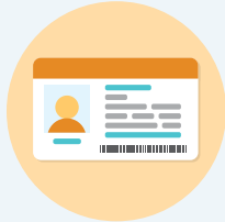
Personal Identification and Demographic Data