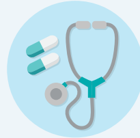
Diagnosis, Procedures and Medication