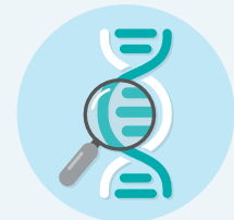
Other Investigation Reports