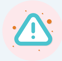
Allergies and Adverse Drug Reactions