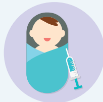
Birth and Immunisation Records