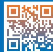
Short Video on Giving Sharing Consent