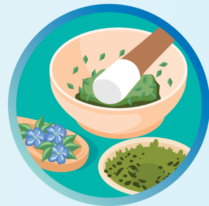
中藥處方 CMs Prescription