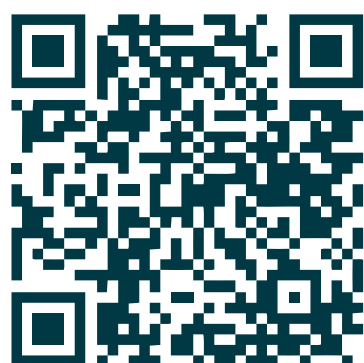
《修訂條例》詳情 Details of the Amendment Ordinance

You can also manage your sharing consent through the eHealth App.